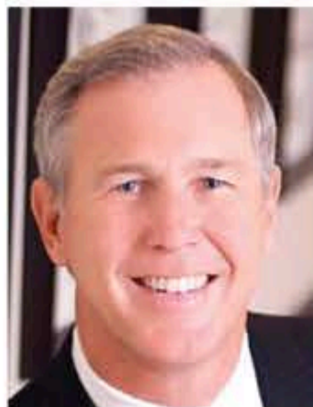
Birtcher: developer might be up for commercial redevelopment of site