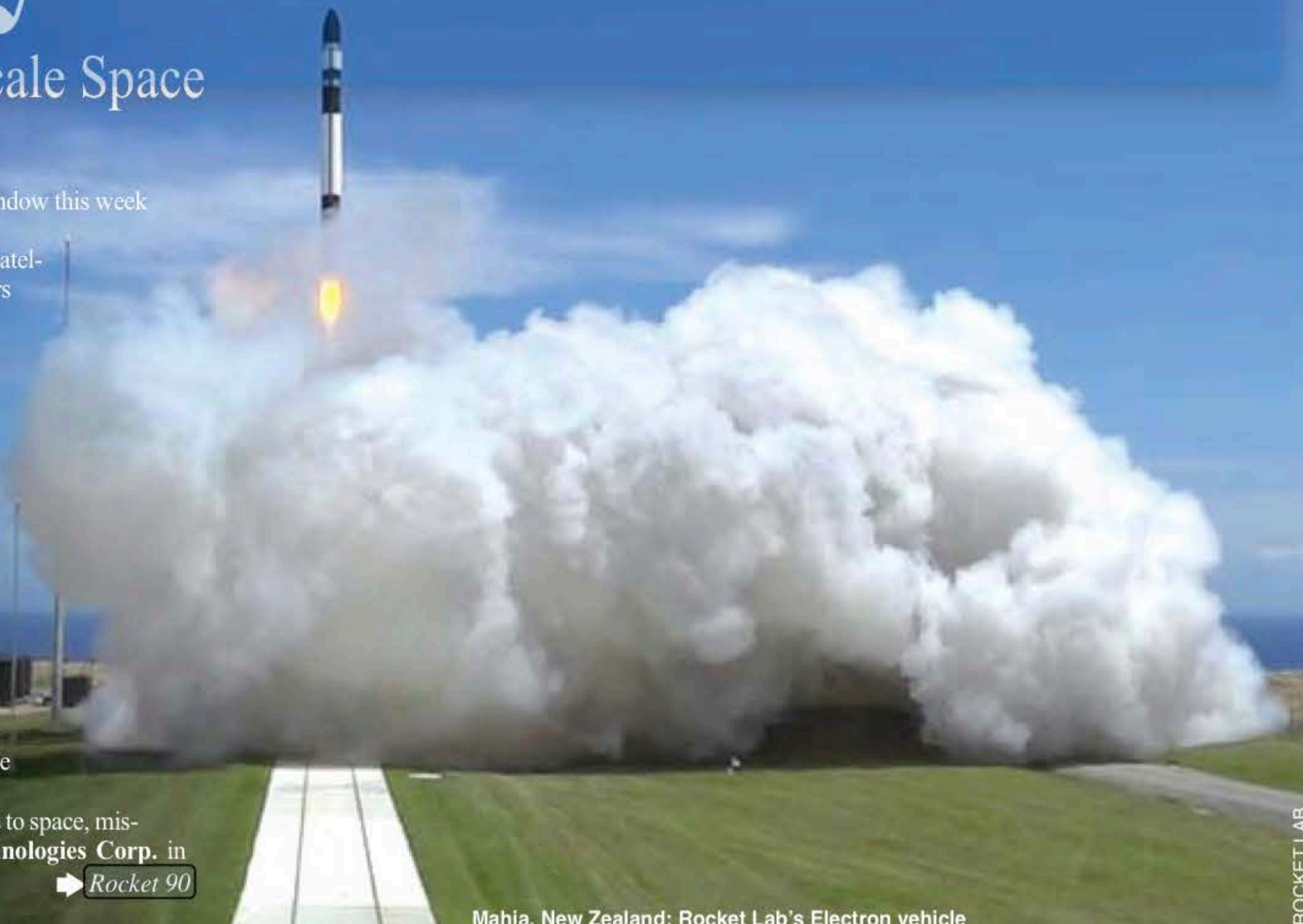
Mahia, New Zealand: Rocket Lab's Electron vehicle