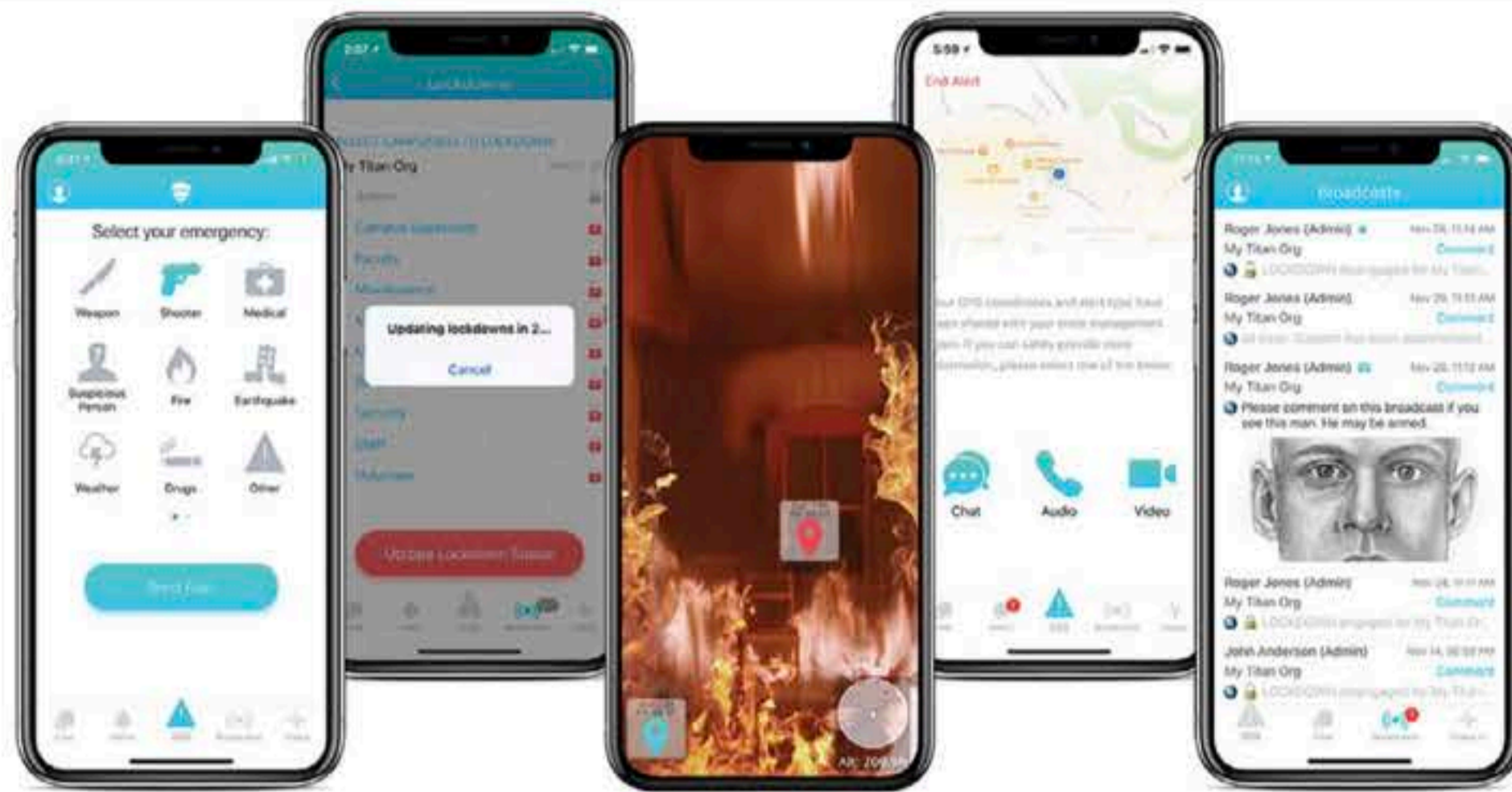
911 app system: launched last year, allows emergency communication, broadcast of alerts, lockdowns and more

Titan Global customers will receive an email that will outline services, such as emergency text messaging. If they download the accompanying app, they can report emergencies and access advanced features, such as real-time