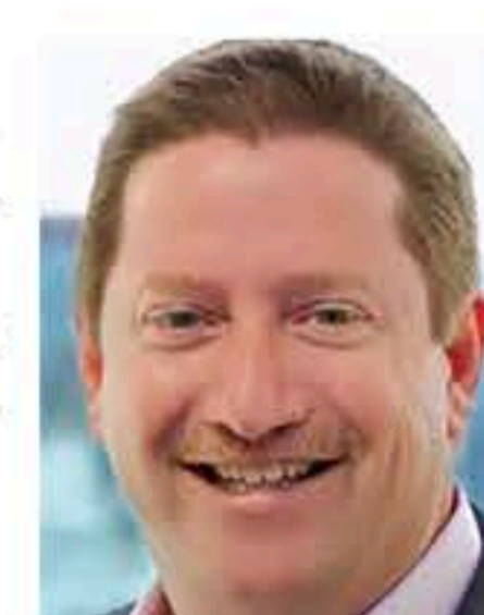
Coffey: product in service industry is people